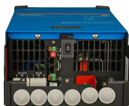
MultiPlus 2000 VA (bottom cover removed)