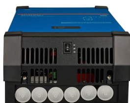
MultiPlus 2000 VA (with bottom cover)